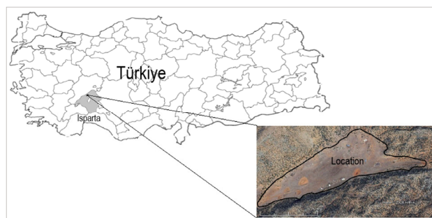
Figure 1. Location of Onkuyular situated not far from the city Isparta, Gençali plain, Türkiye

This study was conducted in 2016–2019 in Onkuyular locality, situated in Gençali village of the Senirkent district of Isparta province, populated by the target species. This area occupies 59.5 hectares and is positioned between the following coordinates: 38°16'51.89" N to 38°16'45.19" N latitude and 30°44'23.19" E to 30°44'22.39" E longitude (Figure 1).