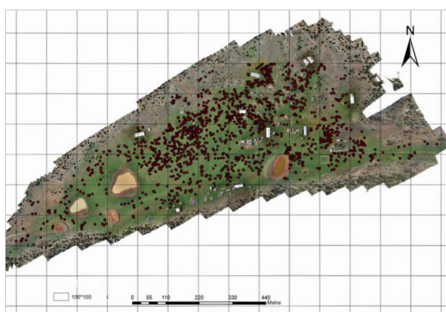
Figure 3. Orthophoto showing species' nest burrows

Notes: ** – Correlation is significant at the 0.01 level (2-tailed); * – Correlation is significant at the 0.05 level (2-tailed).